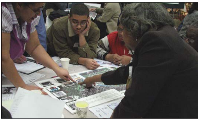
Mapping the Greenway at the 4 th Public Meeting in January