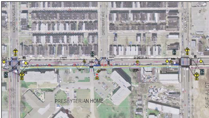
58 th Street Greenway Community Design (DRAFT)