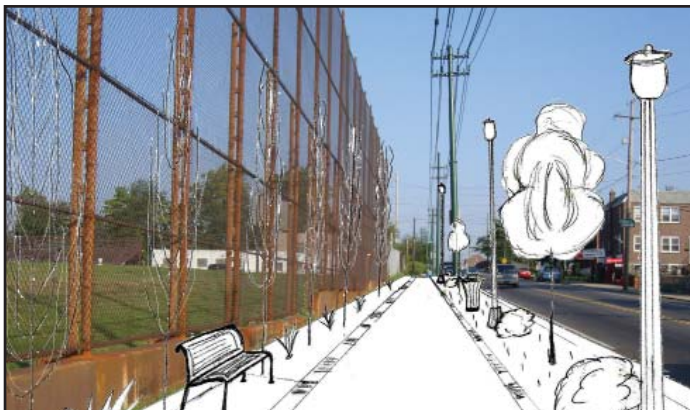
A vision of what the Greenway could look like at Bartram Field along 58 th & Elmwood Ave